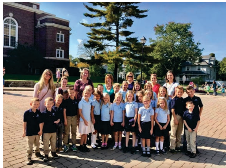
Wheaton College Symphony K-4th Grade