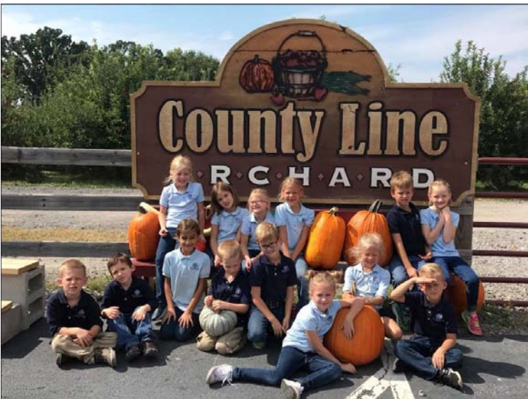
Countyline Orchard K-2nd Grade