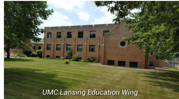
UMC Lansing Education Wing

We encourage you to come and visit when school resumes! We would love to have you sit in on devotions or spend time in our classrooms and discover what Providence Christian Academy has to offer!